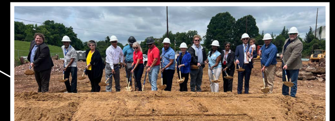
AARON MILLS APARTMENTS 52 units | Senior Housing Complex