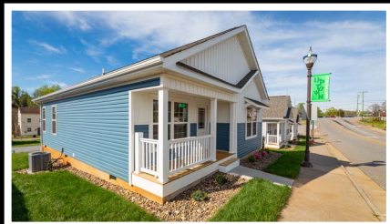
FIVE POINTS COTTAGES 12 Cottages | 2 BR, 2BA