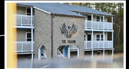
THE FALCON APARTMENTS 1-3 BR Units | Newly Renovated