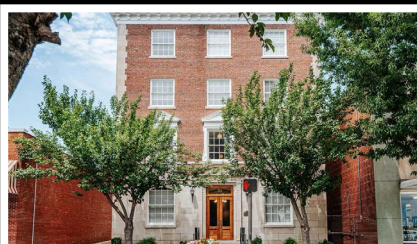
CHIEF TASSEL APARTMENTS 20 Units