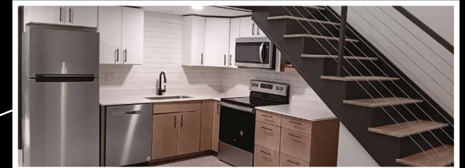
FAYETTE STREET LOFTS 25 units | Fully Leased